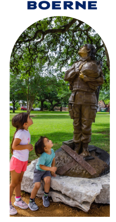
BOERNE PUBLIC ART WALKING TOUR